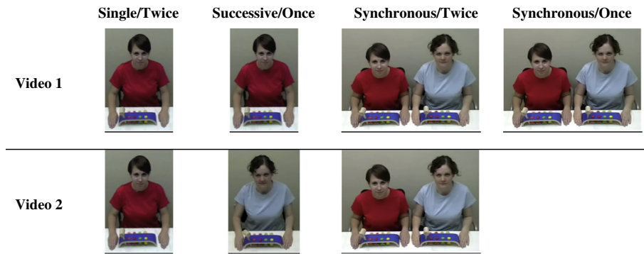
Fig. 2. Schema of the videos children saw for each type of modeling after each kind of frame (convention- vs. outcome-oriented).